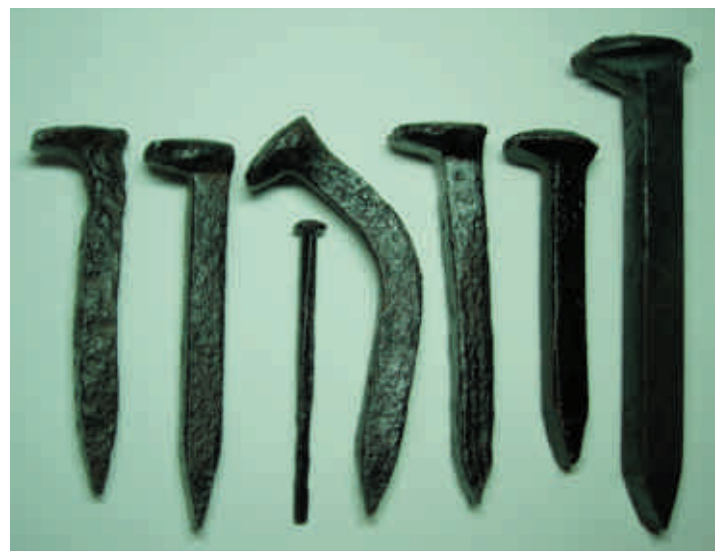
Lurking in the weeds around the old Cluck property and Cedar park depot were these diminutive narrow-gauge spikes and at least one old-fashioned cut nail. Modern standard-gauge spike on the right is shown for comparison.