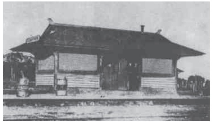
A 1917 photo of the Cedar Park depot, primarily a shelter for passengers and local freight, as at the time it was not a train-order office.

Flash forward more than a century, when veteran ASTA Volunteer Jimmie Burleyson became curious about the area where the depot, the Cluck buildings and the "strolling park" had once stood.